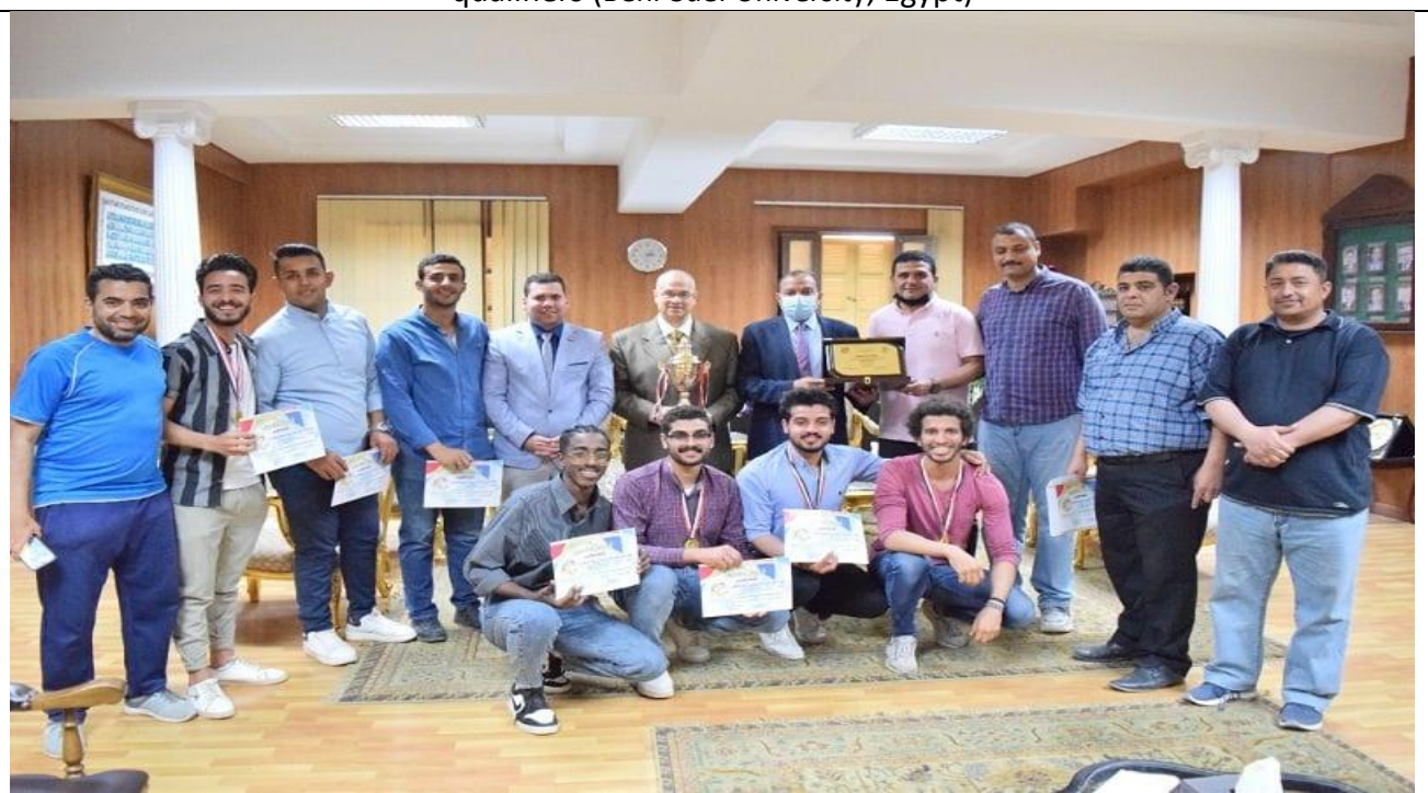
"People Against Extremism"

The participation of a group of "People Against Extremism" contributes within the framework of a clear program by the university towards building awareness, spreading moderate thought, rejecting extremism and fighting terrorism, which is in line with the vision of the political leadership and the efforts of the state in this regard.