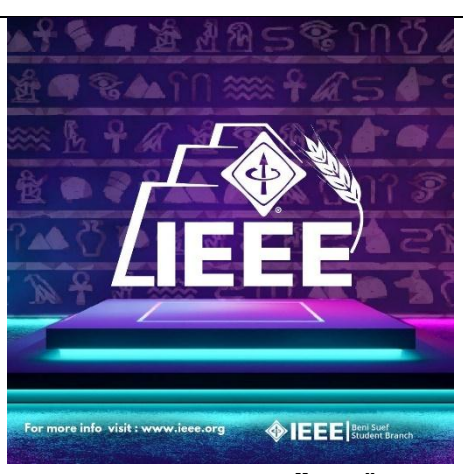
Organization of "IEEE"