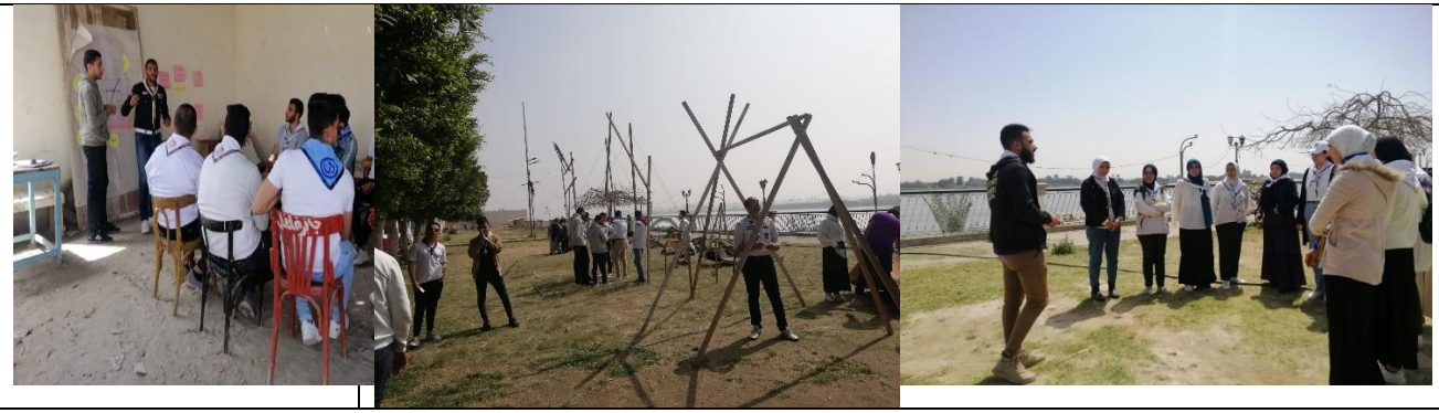
"Scout units" set of students' units existed in every faculty of Beni-Suef university, The Scout units, target to train the university students i.e. how to save the resources, provide solutions for the surrounding environment issues.