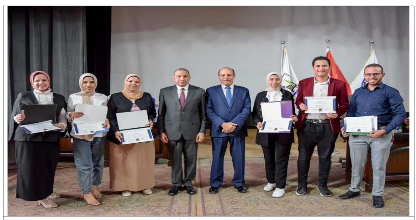
"Youth for Development" The Beni-Suef University Council honors the winners of the "Youth for Development" initiative qualifiers (Beni-Suef University, Egypt)